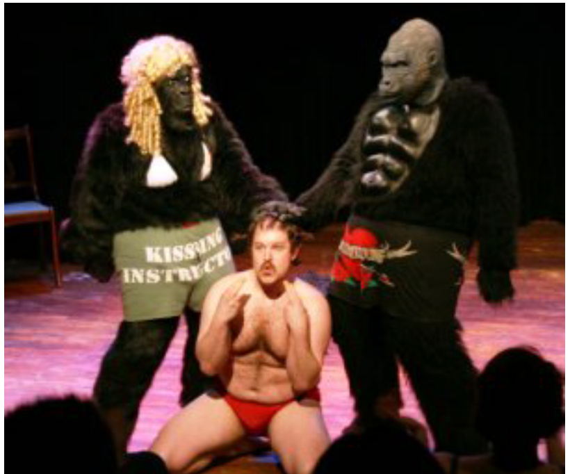
Dick Turdsack (center) goes crazy with Coco and Giganto.

But in the end, it is Giganto who lives up to his name and becomes the hero who saves the