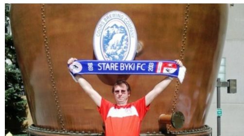
The copper kettle outside the Coors brewery receives a Byki christening.