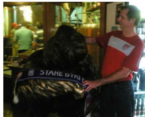
The Wynkoop ape never had it this good in the jungle.

The Byki need more photos of you and your Byki scarf in exotic and fascinating places. Every time you prepare for a trip, make sure to pack your Byki scarf. Don't have a scarf? No problem! We have lots of scarves, so get yours today.