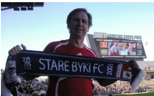
A Byki scarf makes Dick's Sporting Goods Park just a little classier.