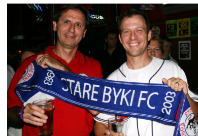
Here's a good motto: Have Byki scarf, will travel.

by Redmonds giving back $11 to the club for every person in attendance. It was clearly a win-win, and the club netted $800 on the night. That's a pretty good haul for just drinking beer.