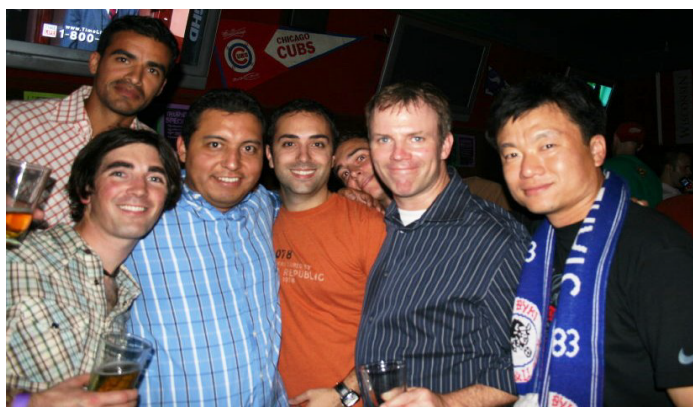
Experienced Byki beer-drinkers ready for action.

All current and former players and fans and supporters are encouraged to attend our visit back to the Billy Goat. We'll be meeting at 7:00 PM. The original Billy Goat Tavern is located near 430 N Michigan Ave on the lower level. See you all there!