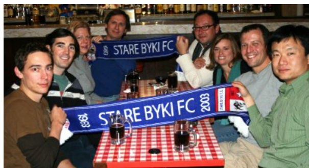
Byki scarves were in abundance at the Billy Goat Tavern.